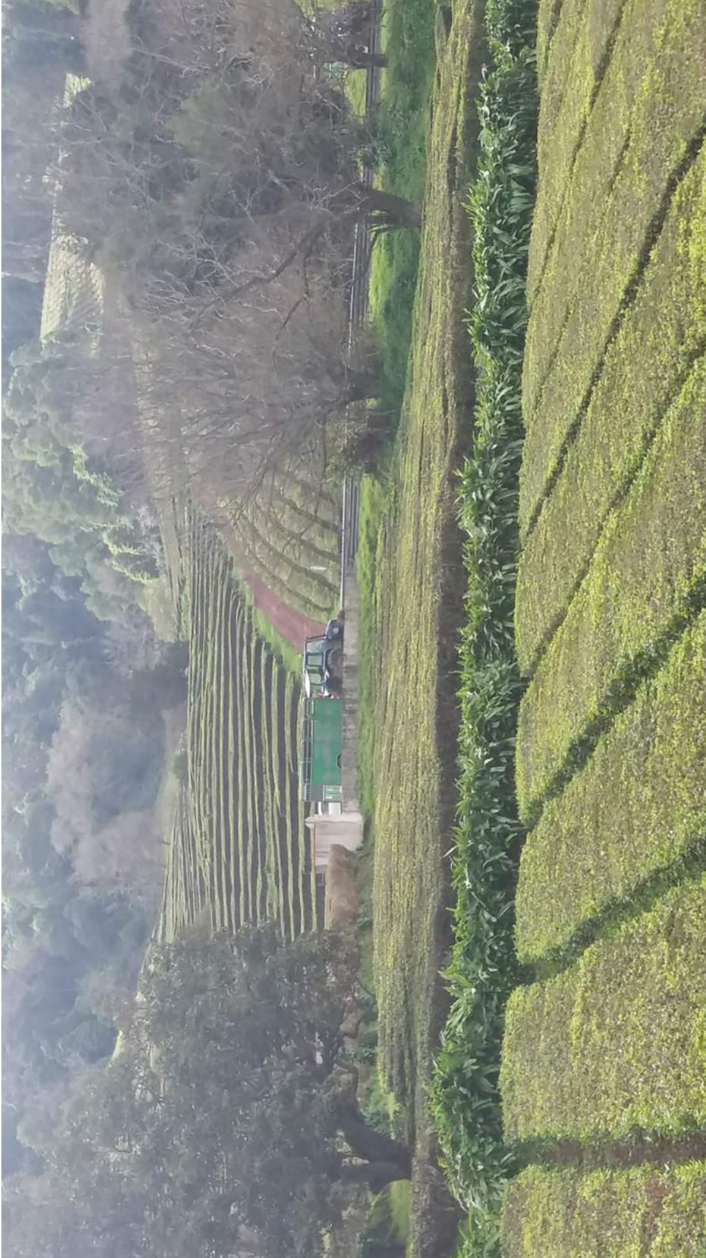
Fig. 3.1 for Question 3 Photograph of an agricultural area in a tropical country